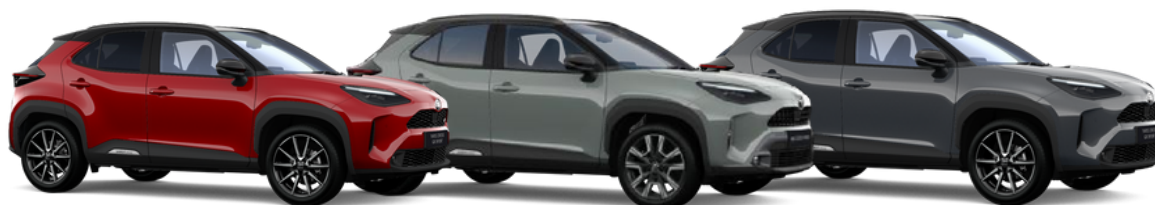
Pearl Red Bi-tone (2SZ) *** *GR SPORT Only*