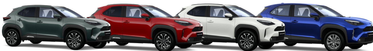
Forest Green (6X7) **