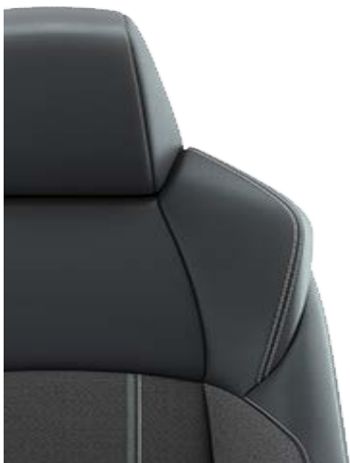
Black fabric and synthetic leather upholstery with grey stitching (Sol) (EA40)