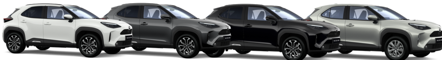
Pure White (040) *