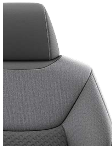
Black fabric upholstery with light black roof lining (Luna Sport) (FC20)