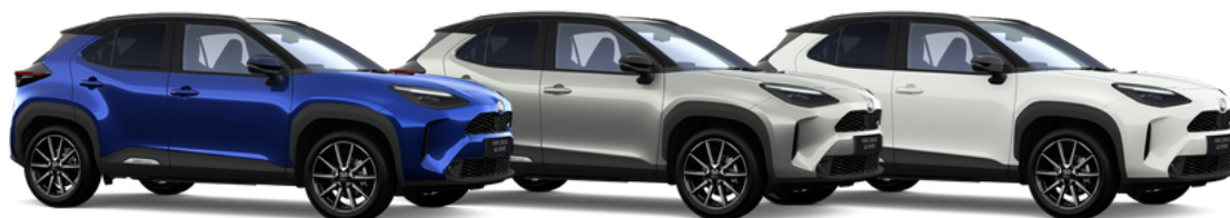
Juniper Blue Bi-tone (M20) **