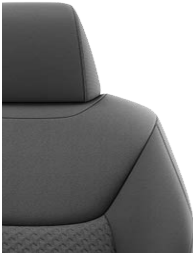
Black fabric upholstery with light grey roof lining (Luna) (FB20)