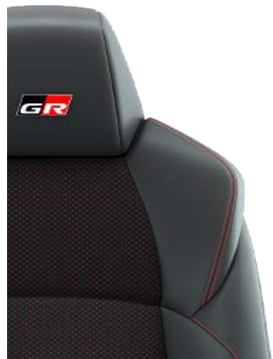
GR SPORT suede and synthetic leather upholstery with red stitching (GR SPORT) (EC20)